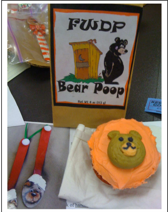
Make it Take it project & goodies